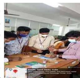
Value Added Course on PCB design

A- one week Value Added Course on '18ECV03 - PCB Design' was conducted from 27.09.2021 to 05.10.2021. 180 second year ECE Students attended this Value Added Course and got benefitted. The students designed Power Supply Circuits with general PCB and drawn the PCB layout using Orcad PSPICE