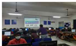
Workshop on 'basic graphic designing'